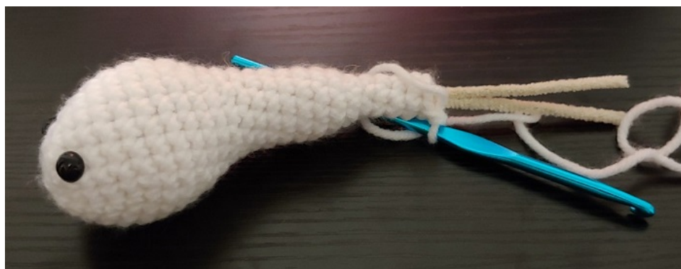
Figure 1: Working on the sperm's tail.