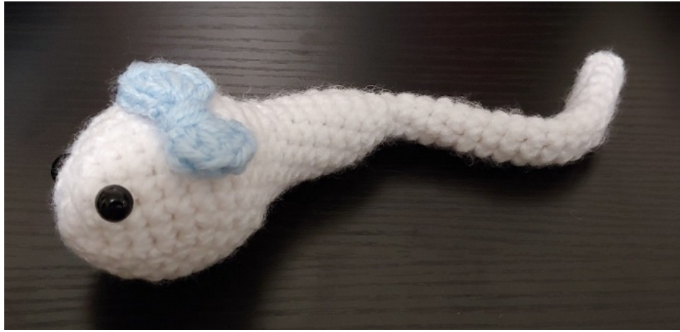
Figure 2: Side-view of the finished sperm.